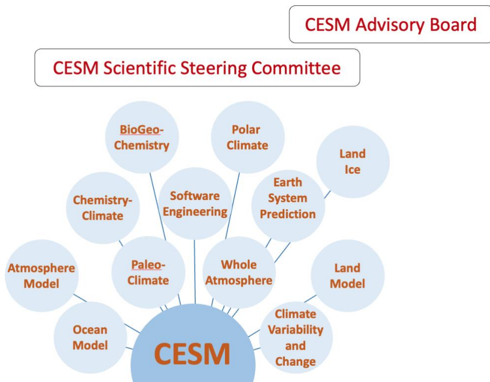
Figure 1. CESM Management.

The twelve Working Groups (WGs) form the foundation of the CESM Project (Fig. 1). The WGs are where detailed discussions occur and where work gets done. Their membership is open to any interested researcher who wants to be involved in the Project. Each WG usually has 2-3 cochairs, representing both NCAR and external communities.