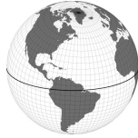
Greenland Pole Grid