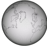
Poseidon Tripole Grid