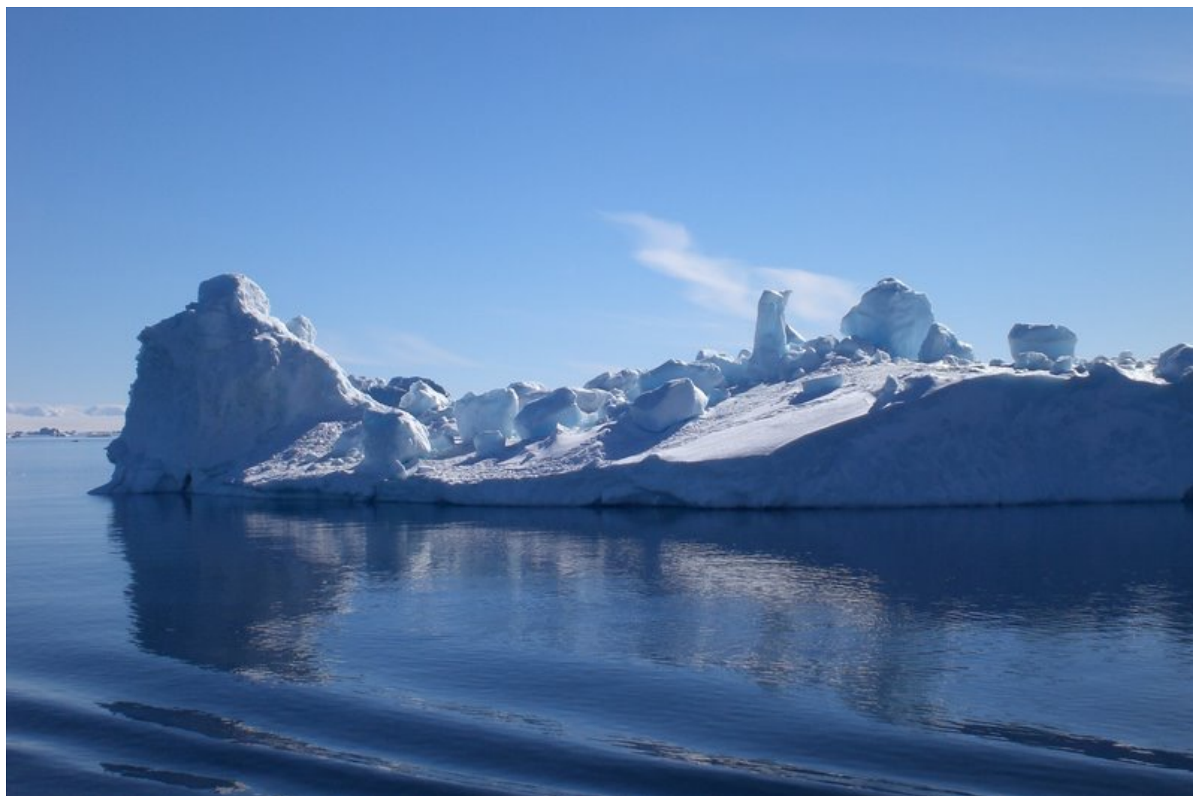
Cute iceberg shot in the Weddell Sea.